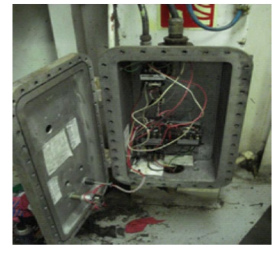
Improperly Modified & Maintained Certified Safe Junction Box