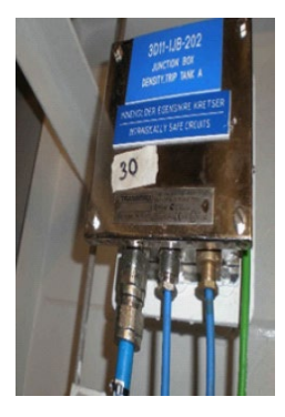
Improper Cable Gland Installation/Modification