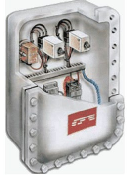
Properly Installed Certified Safe Junction Box

The attribution of fires caused by electrical faults cannot be overstated. The National Fire Protection Agency published Fires in Industrial and Manufacturing Properties in March 2018 and reported that "electrical distribution and lighting equipment (24%) was the leading cause of structural fires in industrial properties from 2011-2015." The International Union of Marine Insurance issued a press release IUMI Voices Concerns over Growing Number of Roro Fires reporting that, "marine accident reports in recent years have identified several sources of fires....a significant (leading) number of these incidents have occurred because of electrical fires."