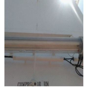
Standing Water in a Certified Safe Flameproof Light Enclosure Indicating Failed Ingress Protection